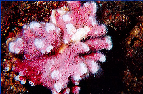
A multitude of unusual and colorful invertebrate species such as sponge, tunicate, bryozoan and corals grow directly on the concrete and steel reef materials.